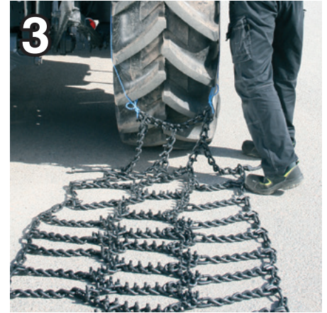
3 Put the rope on the top of the tire.