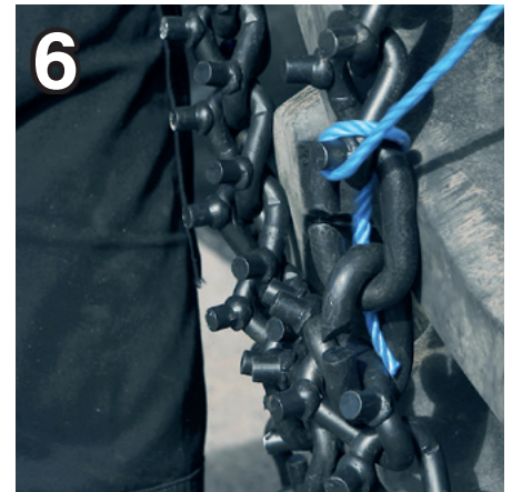
6 When the chain ends meet, connect the links slanted gap upwards. Remove the rope.