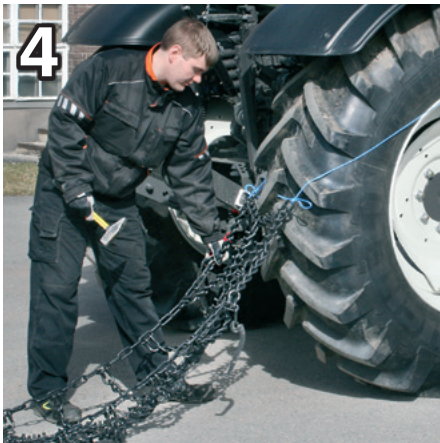
4 Drive forward one circuit, keep the chain narrow.