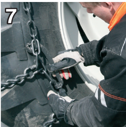
7 Fasten the chain with the fasteners, inside first and then outside.