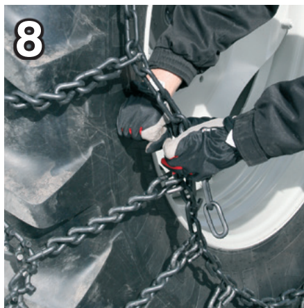
8 A good rule is that your hand should fit between the tire and the chain. Do not tension too tight.