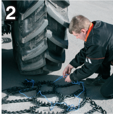
2 Fasten the rope in the middle of the chain.