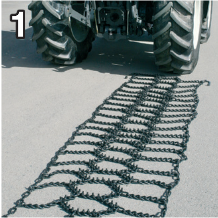
1 Put the chains behind the tire with the fasteners against the tractor and the studs facing up.